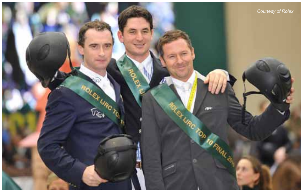
The top three finishers in the €250,000 Rolex Top 10 Final, from left to right, Denis Lynch of Ireland (second), Steve Guerdat of Switzerland (winner), and Eric Lamaze (third).