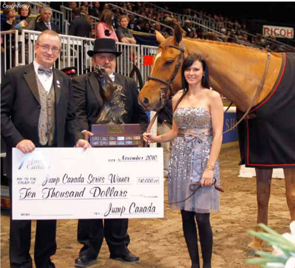
Jump Canada Series Presentation

The Jump Canada Series has proven successful in providing a national jumper circuit with high standards of competition across the country. At the end of the Jump Canada Series, overall standings are calculated using the best six results, plus the final event in the Jump Canada Series at the CSI-W Royal Horse Show in Toronto, ON.