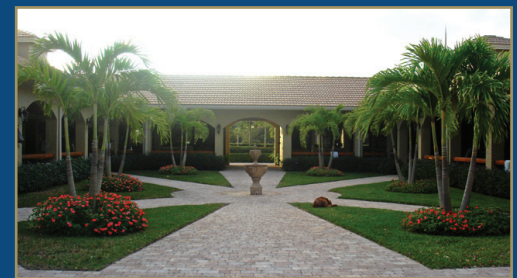
GRAND PRIX VILLAGE LOCATION, LOCATION!

Exquisite 16 stall courtyard barn located in Grand Prix Village with Riso 2000 all-weather ring. Great lay-out, designed with rentals in mind, features 2 staff quarters, 4 paddocks, 2 tack rooms, and owner's quarters with full bath and kitchen. A comfortably small farm in a sought after location!