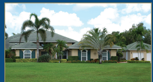
APPALOOSA TRAIL JUST LISTED!

A private 3 bedroom and 2.5 bath remodeled home with high ceilings, marble flooring, and granite countertops. Hurricane ready with whole house generator. This home sits on two acres on the bridle path, awaiting your barn and ring. Prime location on the south side of Greenbriar, close to horse show.