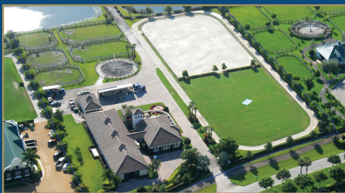
GRAND PRIX VILLAGE ACORN HILL

Situated on two lots totaling 5.88 acres with private entrance to the horse show. 16 stall barn includes office, tack room with kitchen and all of the amenities. Separate 2 bed, 2 bath owners quarters with office, kitchen and walk-out entertaining area. Grand Prix field, all-weather ring, and sand track complete the facilities.