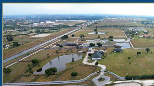
PALM BEACH POINT HACK TO THE HORSE SHOW!

This 10 acre property has a well laid out center aisle barn with 10 stalls. The barn also features a 1 bedroom apt., tack room, feed room, and wash stall. Located in desirable Palm Beach Point, this farm is well located and on high and dry land. A 3 bedroom, 2 bath open floor plan home completes the package.