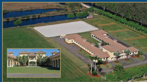
40TH STREET SOUTH JUST LISTED!

Great location close to the horse show. Brand new 20 stall barn with modern amenities on 10+ acres. Just completed at the start of the 2010 season and awaiting your finishing touches. New ring and paddocks. Property features 3 bedroom, 3 bath owner's quarters and staff can live on-site in two 1 bedroom apartments.